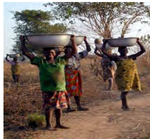
Carrying water home for cooking.