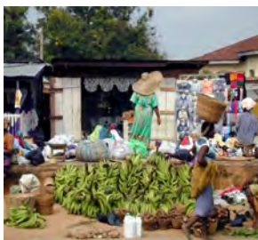
Selling bananas in a Ghanaian market.