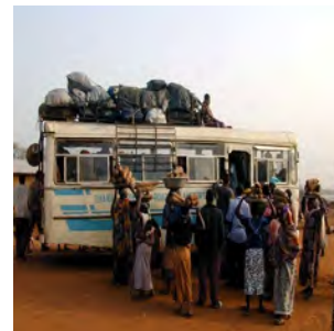
People boarding a bus in rural Ghana.