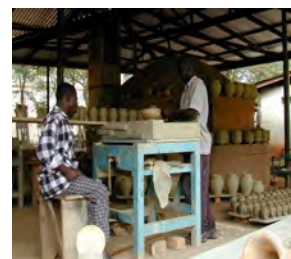
Making pottery in Ghana.