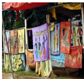
Selling cloth in a Ghanaian market.