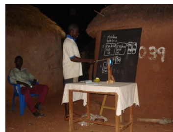
Teaching a GILLBT literacy class near Tamalé, Ghana.